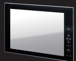
Touch Panel Industrial Computers