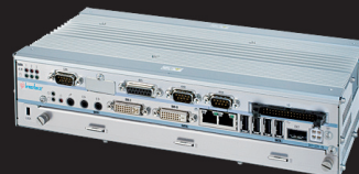
ECO Industrial Computers