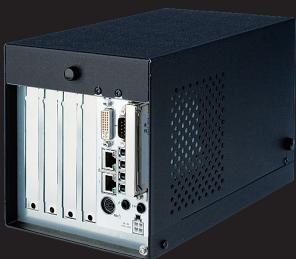
Long-Term Supply Industrial Computers