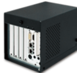
Core i7 3517UE 1.7 GHz 4-Slot Back