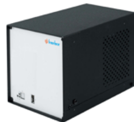
Core i7 3517UE 1.7 GHz 4-Slot Front

Core i7 3517 UE 1.7 GHz (click here for product data sheet)